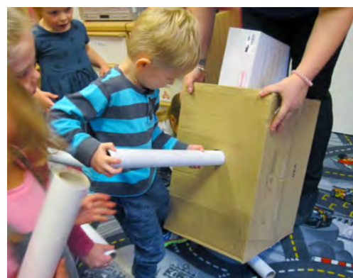
Helping to create the recycle robot.