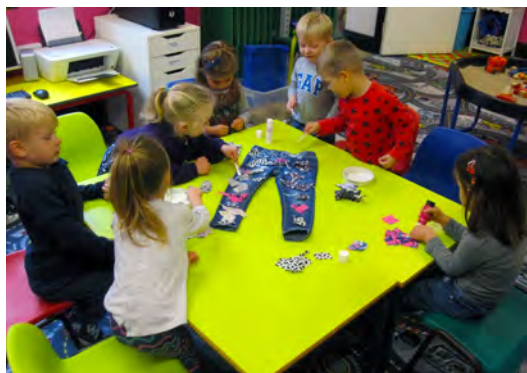
Helping to decorate a jeans as part of group activity.

On 22nd September we participated in Jeans for Genes Day. The staff and some the children wore jeans for the day to help raise money for this worthwhile cause. They also helped to decorate a pair of jeans, cakes and biscuits. There is fundraising box on the front desk at nursery and we would greatly appreciate further contributions, however small.