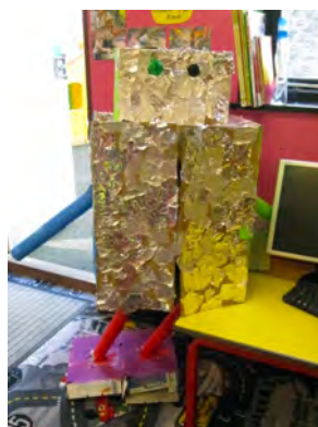
The finished article.