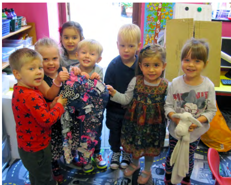
Some of the children proudly showing off the finished pair of jeans.