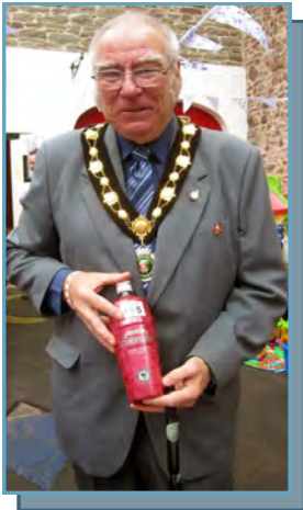
The Mayor with his bottle of Cosmopolitan!