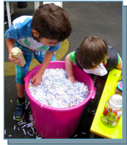
Rafferty & Otis digging deep in to the lucky dip searching for a prize