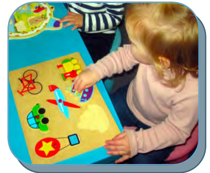
Scarlett completing a transport puzzle