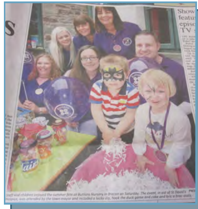
The front page of the Brecon and Radnor 20th July 2017

Are you aware of our 'Refer a Friend Scheme'? Ask a member of staff for more details.